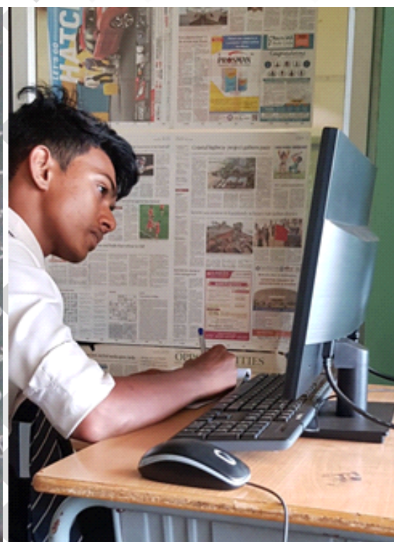
Coaching class, training session and online test