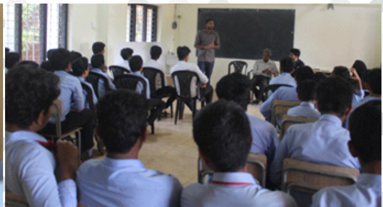
A session on sports and games: Gokulam FC Team Manager speaks about Football club management and career in the field of football.