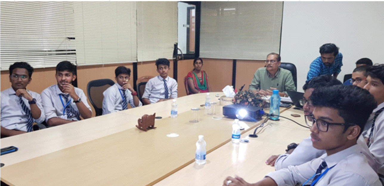
Intercation with Division Manager of VKC