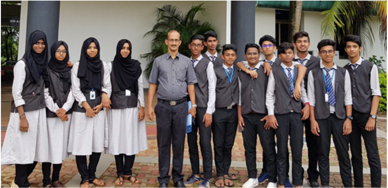
Visit and interaction at IIM Kozhikode

Visit to eminent educational institutions in India that inspire students to set a goal for their future endeavours.