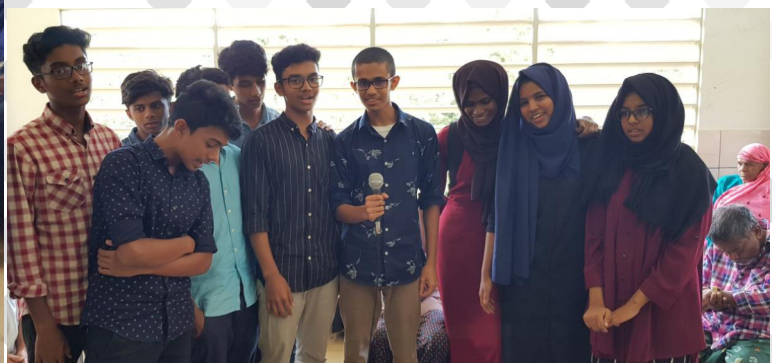
A Visit to Peace Village Wayanad