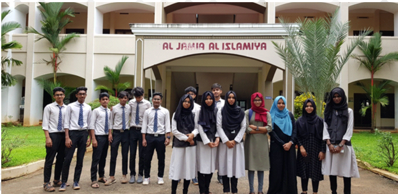
A visit to Al Jamia Al Islamiya