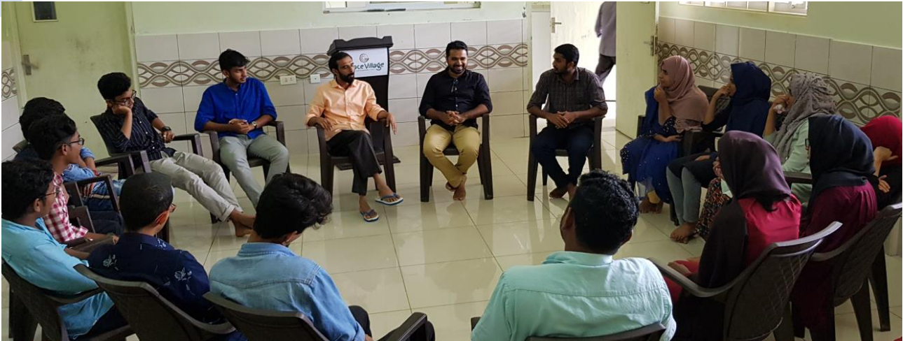
Students interacting with Islamic Scholar and writer Sadaruddin Vazhakkad