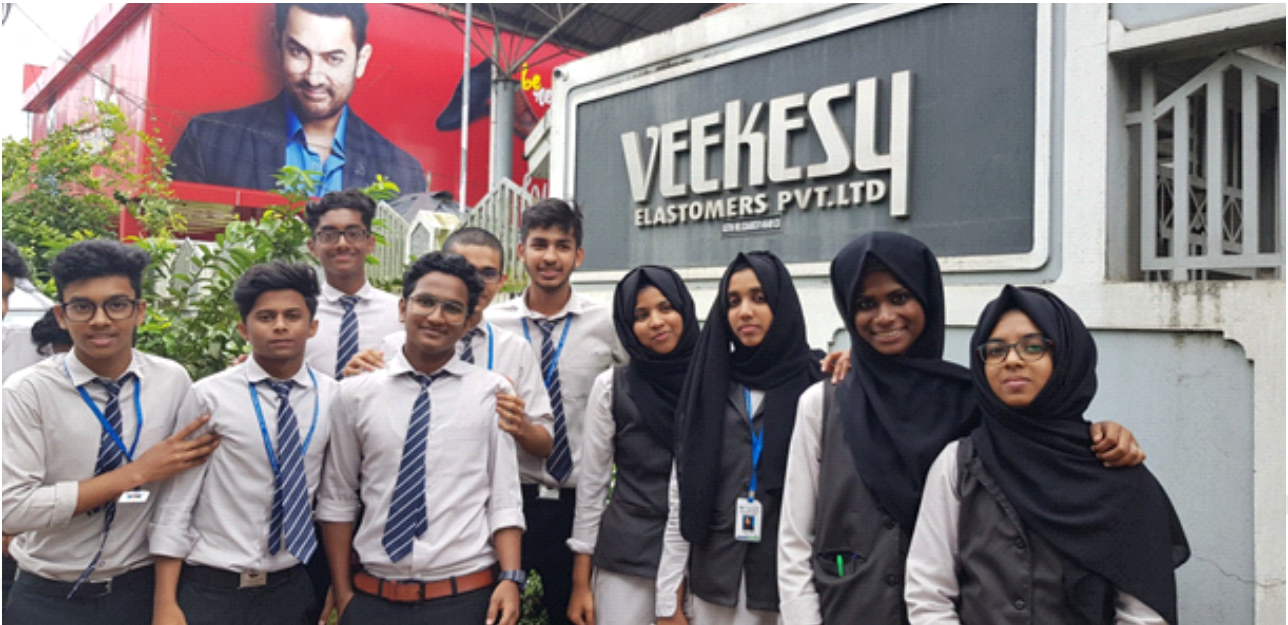
Industrial visit to VKC

Gain the skills needed to accomplish things beyond one's imagination. Able to plan career with the exposure to real-life working processes of different firms.