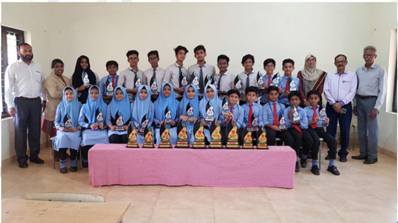
Synergy-Intelligentia 2019 Overall Champions...